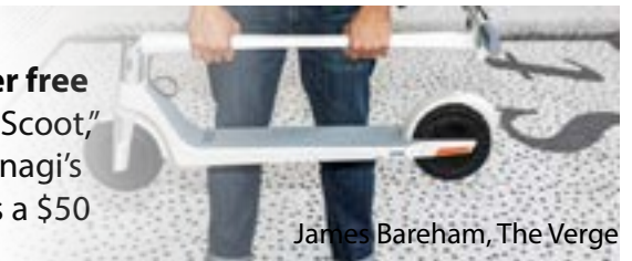
James Bareham, The Verge

Google partners with Unagi, an electric scooter manufacturer, to offer free scooters to employees as they return to the office. The program, "Ride Scoot," reimburses U.S.-based Google employees for a monthly subscription of Unagi's model One scooter. The subscription service costs $44.10 per month, plus a $50 enrollment fee.