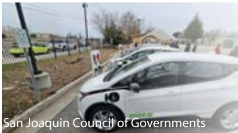
San Joaquin Council of Governments

Míocar, an electric vehicle (EV) carsharing organization announces plans to expand operations to San Joaquin County, California. Individuals may use a car for $4 per hour or $35 per day, including 150 miles of usage, charging, and insurance. This carsharing program is funded by the California cap-and-trade program, which provides government incentives to advance the clean mobility marketplace.