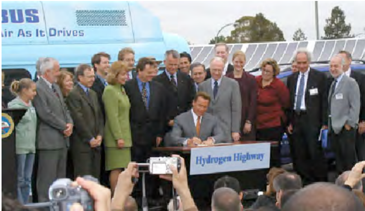
Figure 1: Governor Schwarzenegger signing Executive Order S-7-04 at UC Davis.

In support of the California Zero Emission Vehicle (ZEV) mandate goals to introduce low- and zero-emission vehicles in California, Governor Schwarzenegger announced his intent to create a “California Hydrogen Highway Network” by signing Executive Order S-7-04 on April 20, 2004. He signed the order at a new hydrogen refueling station at UC Davis, dubbed “Station Number 1” by the California Fuel Cell Partnership (CAFCP) because of its public availability.