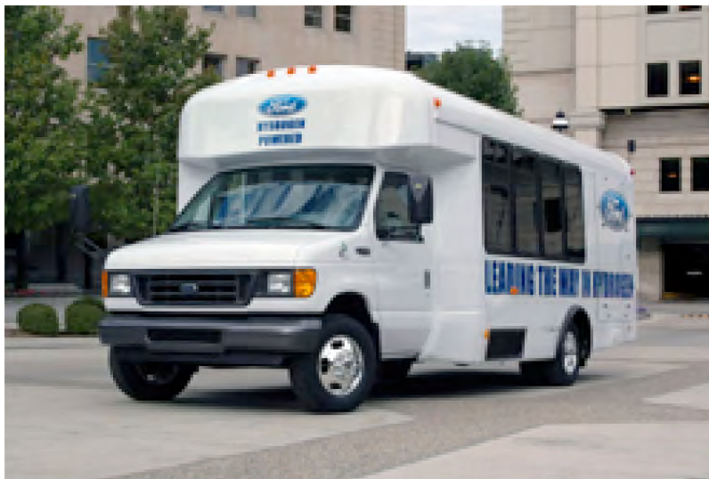
Figure 3: Ford “H2ICE” E-450 hydrogen-powered shuttle bus. Source: Ford Motor Company

In terms of demonstration and pilot project activities to-date, Florida’s efforts are concentrated in the Orlando area. Five Ford Focus FCVs will be demonstrated in North Orlando with refueling infrastructure provided by BP in a program funded under the U.S. Department of Energy’s “Controlled Hydrogen Fleet and Infrastructure Demonstration and Validation Project” (Barber, 2005). In a second project, eight Ford E-450 shuttle vehicles will be deployed at the Orlando airport starting in 2006. These hydrogen combustion vehicles use a 6.8-liter V-10 battery? and about 26 kilograms of hydrogen, stored at 5,000 pounds per square inch of pressure, to produce a driving range of about 150 miles (McCormick, 2005).